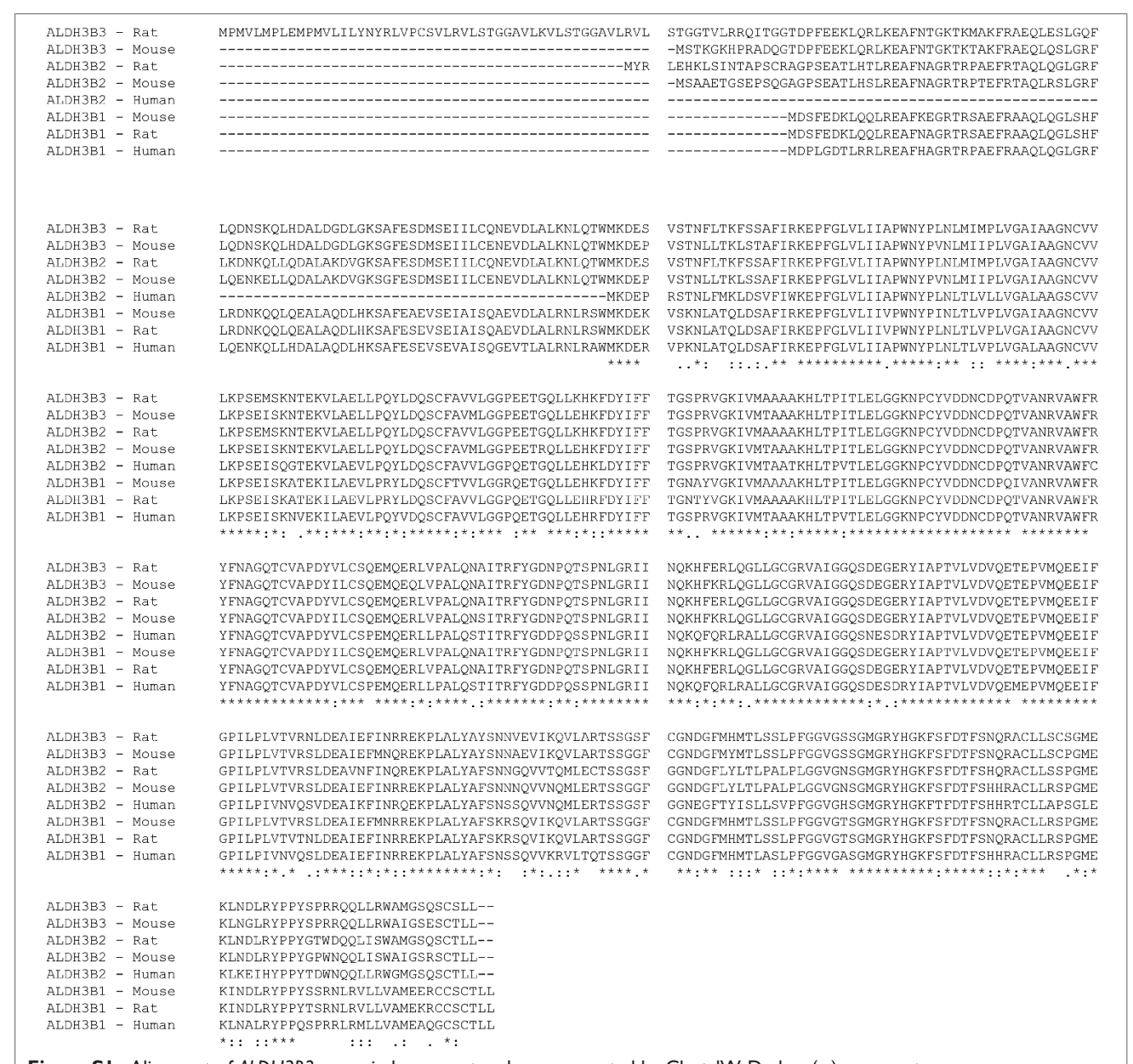
Figure S1. Alignment of ALDH3B2 genes in human, rat and mouse created by ClustalW. Dashes (–) represent sequence gaps, asterisks (*) represent identical amino acids (AAs), colons (:) represent very similar AAs, periods (.) represent less similar AAs, whereas spaces () represent dissimilar AAs.