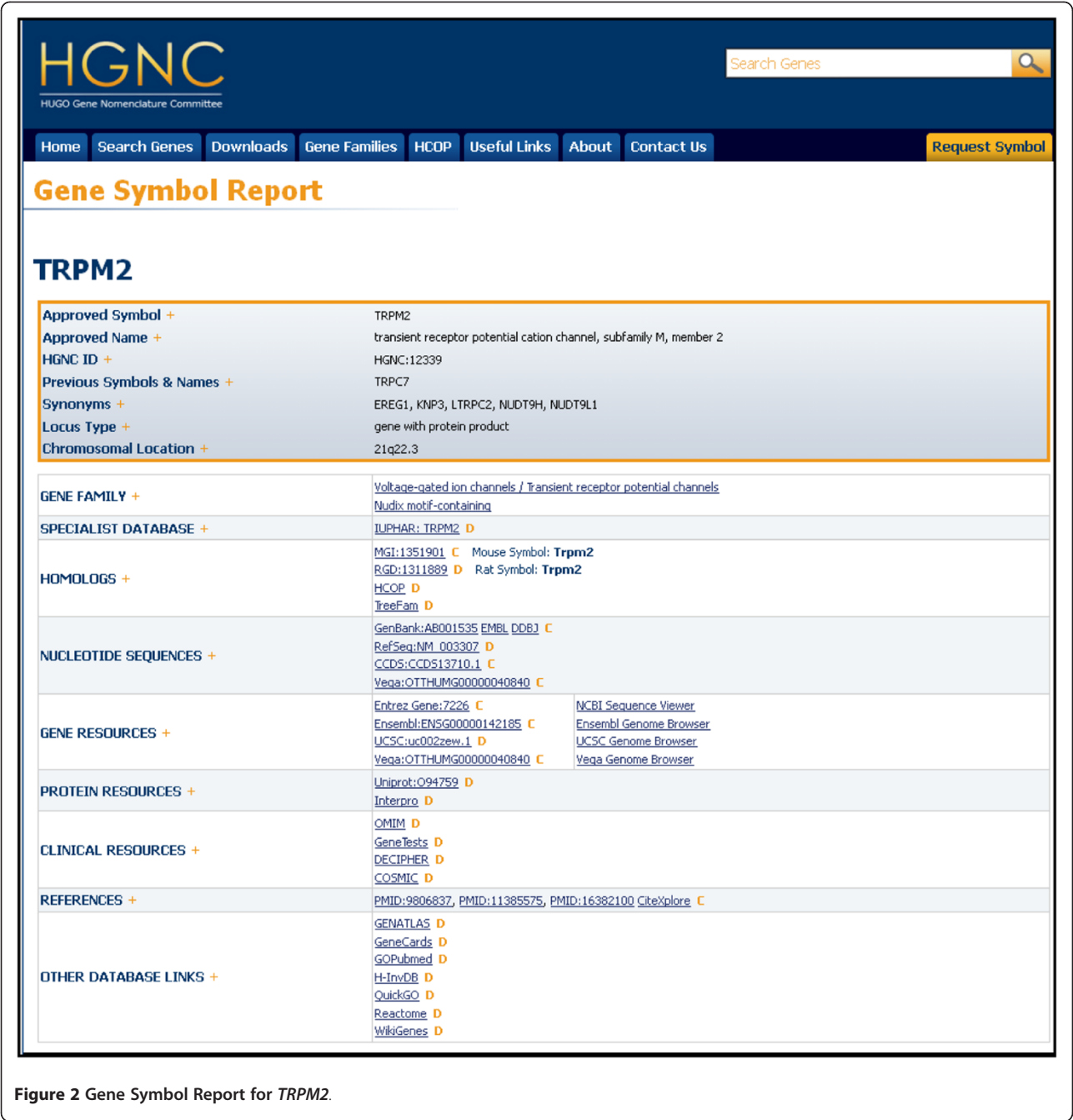
Figure 2 Gene Symbol Report for TRPM2 .

from the ‘pseudoautosomal region’), secondary structure (e.g. ‘micro RNAs’) or a grouping that provides a useful community resource (e.g. all genes encoding ‘blood group’ antigens). These groupings do not usually share a common root symbol, and again, one gene can be a member of more than one gene family and/or grouping. When assigning genes as members of families and groupings, the HGNC look at all available data including sequence similarity and conserved domain structure, publications and other databases, and where possible, take advice from specialist advisors who are experts working on that specific family or